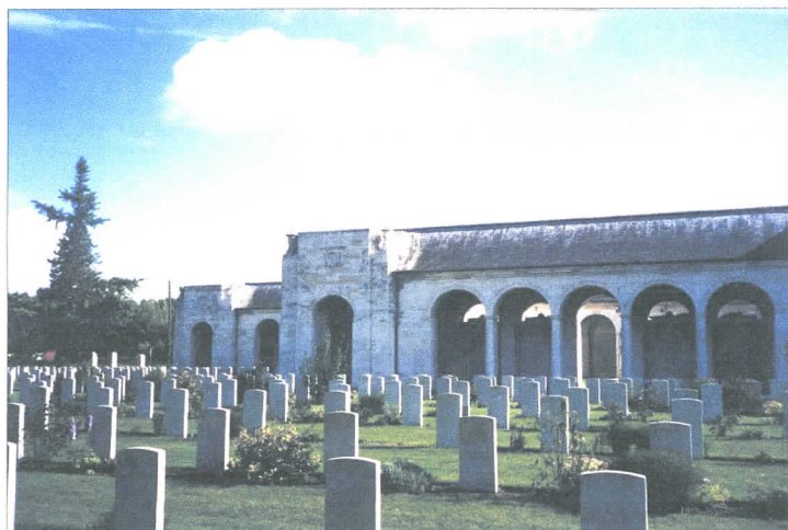
LE TOURET MEMORIAL