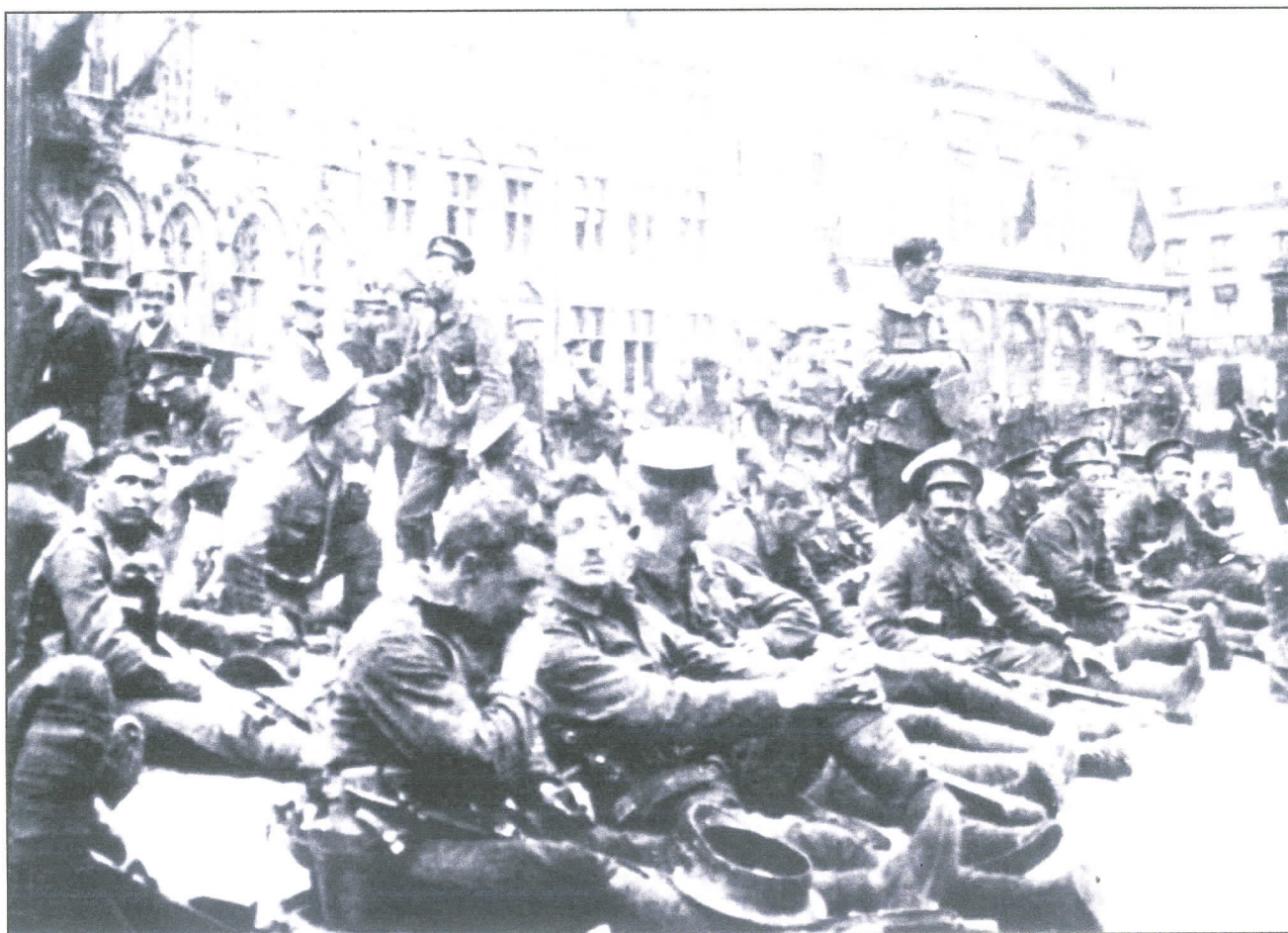
4 th .Battalion Royal Fusiliers – Mons – 23 rd .August 1914