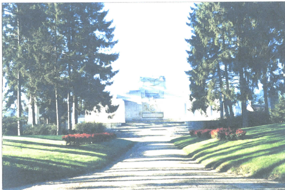
LA FERTE-SOUS-JOUARE MEMORIAL